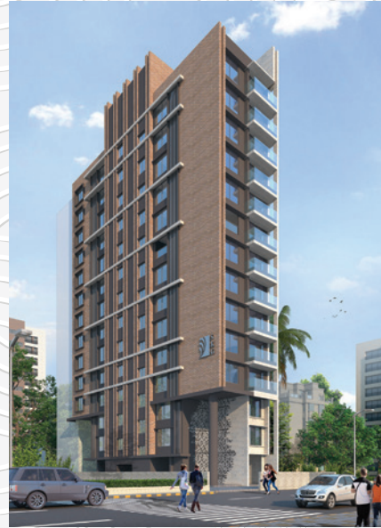
Devasya 15th Road, Chembur