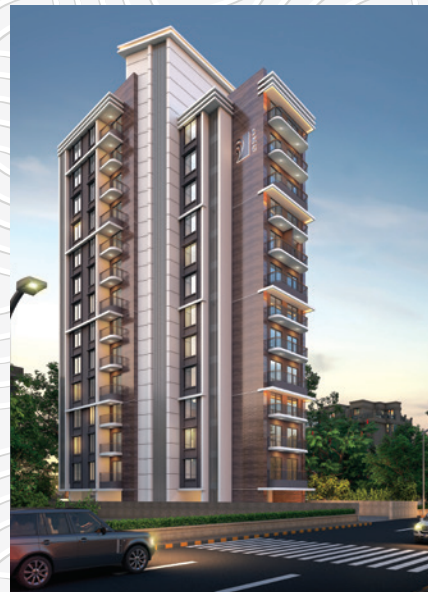
Pinnacle Sindhi Society, Chembur