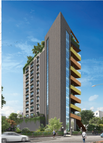
Amarante 5th Road, Chembur