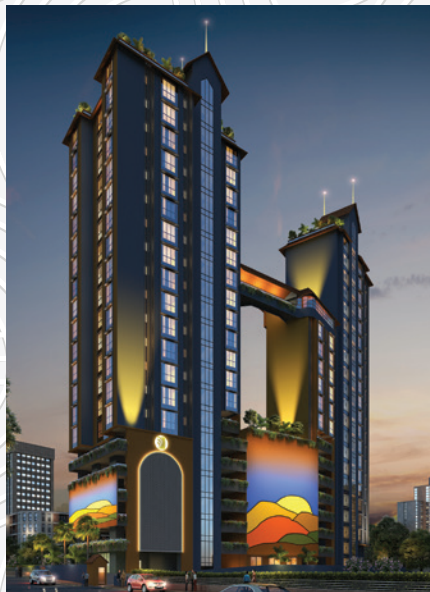
Mount Resort Deonar Farm Road